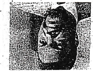
Robert F. Williams